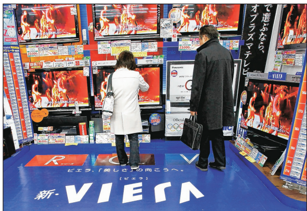
Shoppers look at Panasonic's flat-panel TVs at a discount store in Tokyo, Japan.

Figuring out how such moral hazard — which allows investors to make risky bets without the threat of losing their money because they know governments will bail them out — can be avoided, without sending those same investors into a panic about losing their money, will be a tricky task for the EU and its member states in the months to come.