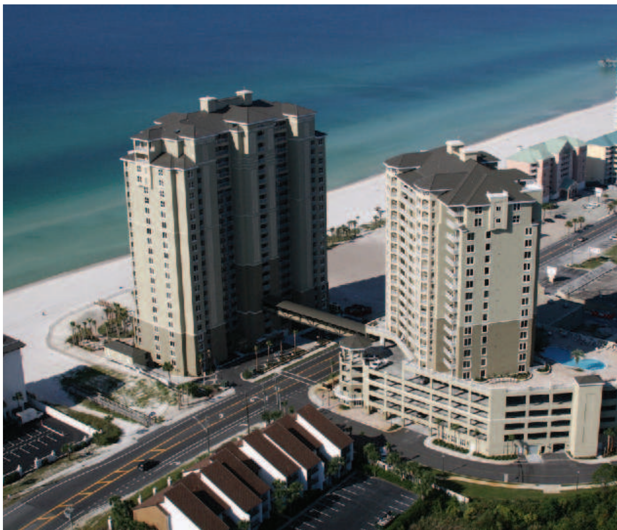
GRAND PANAMA BEACH RESORT

In conjunction with this news, Grand Panama Beach Resort is excited to announce the launch of a newly branded website featuring consumer-friendly navigation, photos, and informative content to educate guests in their search for upscale accommodations on the Gulf of Mexico's pristine beaches. In addition to providing comprehensive information about the resort and its on-site services and accommodations, an interactive blog and Facebook social marketing platform is integrated to give guests a day-by-day glimpse into life at the beach. Visit www.grandpanama-beachresort.com or www.resortspcbeach.com .